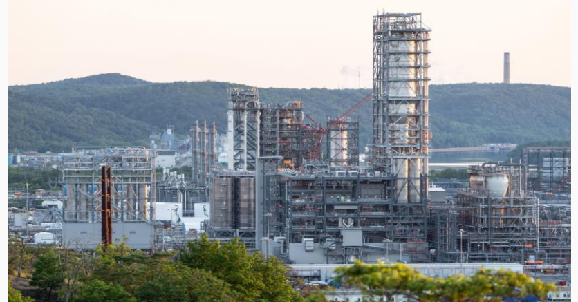
Shell Polymers Monaca - Beaver County

$9.9 million paid for exceeding emission limits in 2022-23