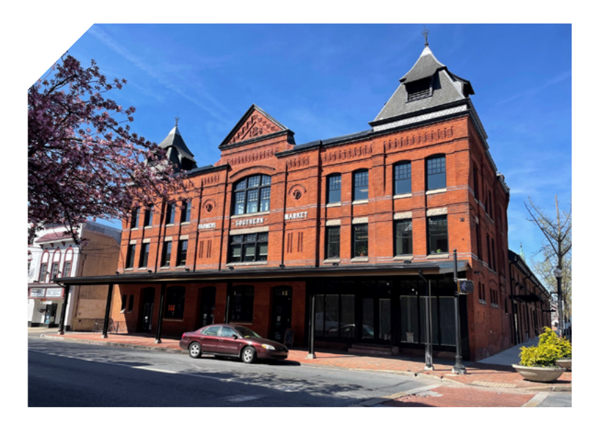
Southern Market is located at 100 South Queen Street.